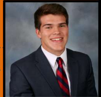
"The sky is NOT the limit!"

Follow us on Facebook for more info on events and ways to donate at Tanner Wray Foundation!